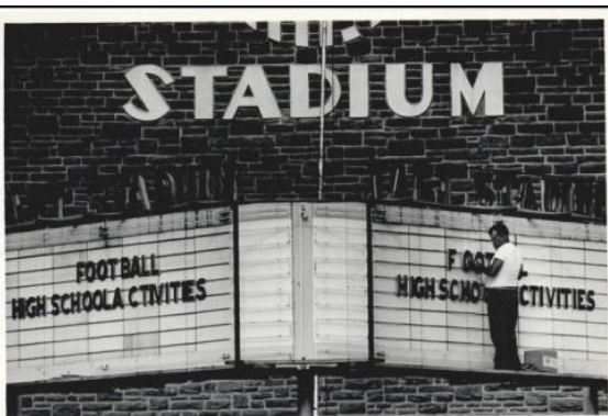
Originally, the marquee was 2-sided, split out as a Y, and stood on poles in the parking lot in front of Taft.